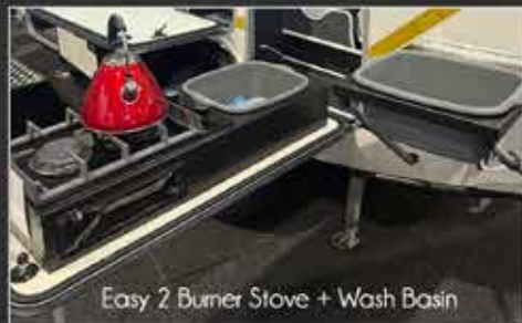
Easy 2 Burner Stove + Wash Basin