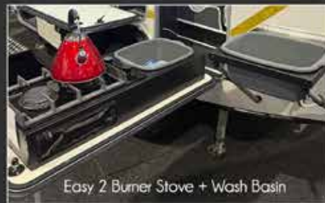
Easy 2 Burner Stove + Wash Basin